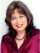
Tax Assessor Collector