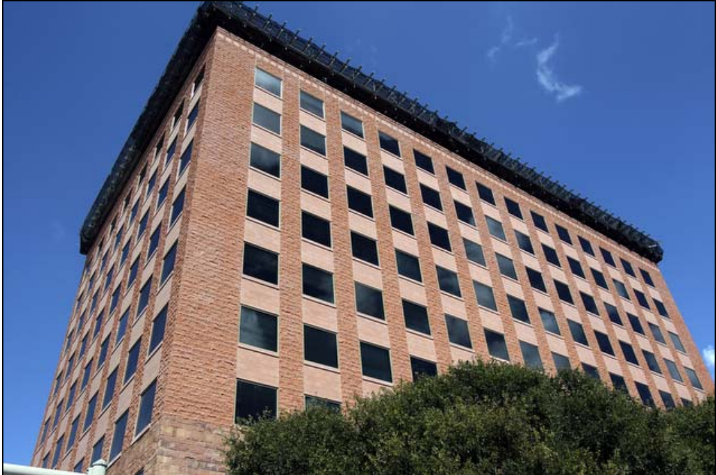
Justice Center Expansion, 2010