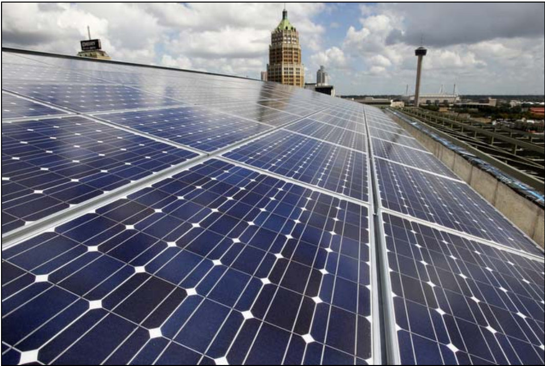
Photovoltaic Solar Panel System, 2010

On the roof of the new Justice Center Expansion Facility lies the County’s first solar photovoltaic system. This alternative energy project is one of the many attributes that gives the new building a Silver LEED Certification.