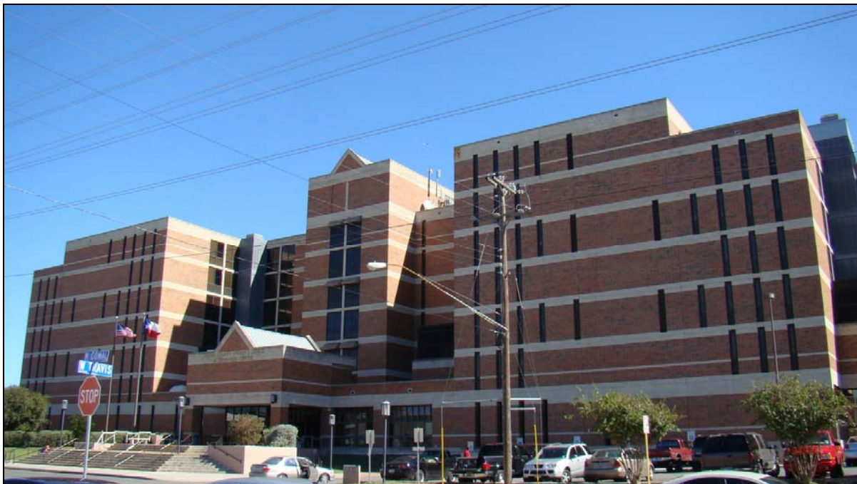
Bexar County Jail on North Comal, 2010: